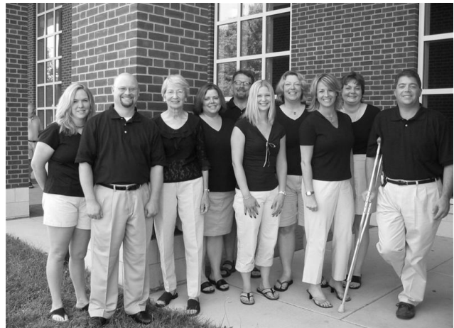
Trinity Ringers 2005