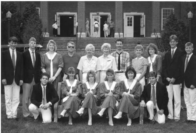
Trinity Ringers 1987