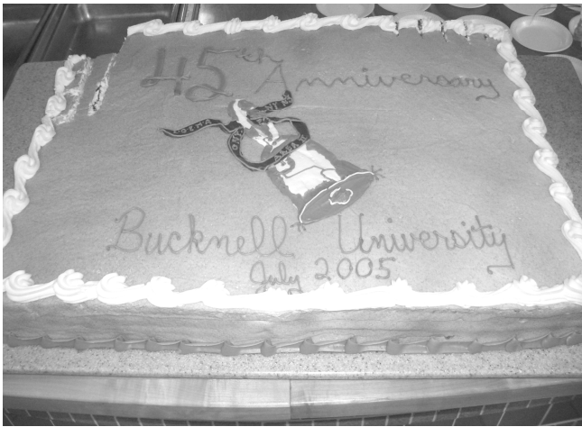
The 45th Anniversary Cake