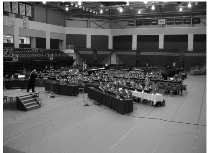
Young Ringers in Rehearsal